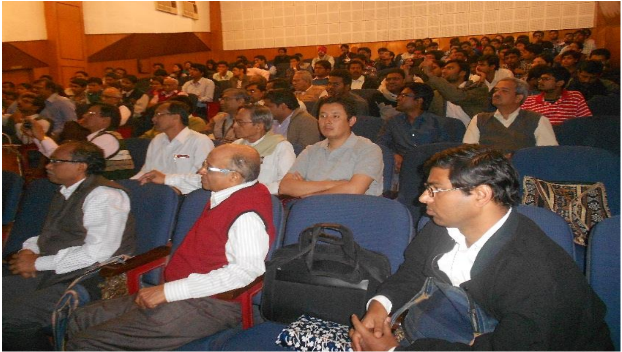
A part of the audience

Mathematics” in the light of modern science and showed that it is neither “Vedic” nor is good mathematics.